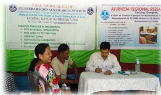
Free Medical Camp in Namthang, South Sikkim