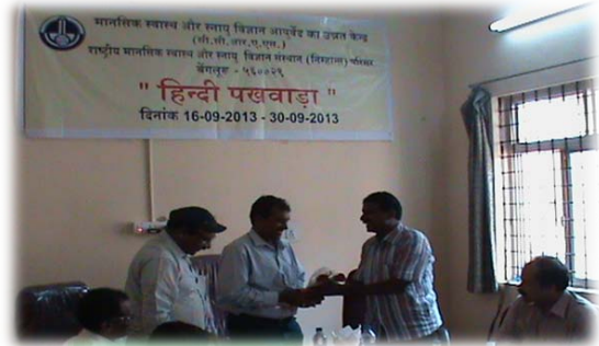
A view of concluding ceremony of Hindi Pakhwada at ACAMHNS, Bangalore