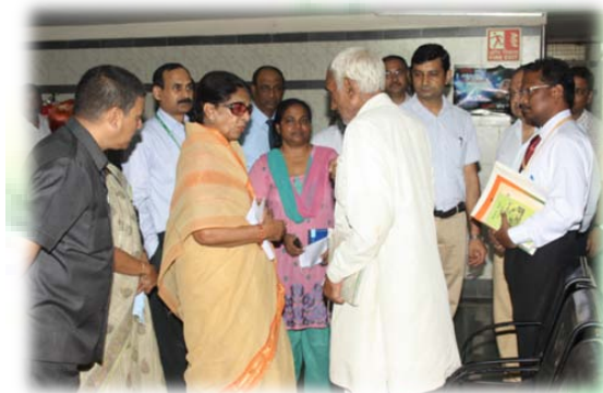
Visit of Honorable M.O.S. Smt. Santosh Choudhary to Ayurveda Treatment Centre at Safdarjung Hospital, New Delhi on 23.08.2013