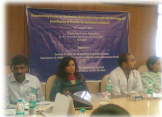
A view of brainstorming session at Dr.R.P Centre for ophthalmic sciences, AIIMS, New Delhi