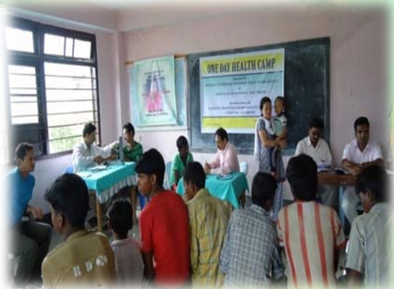
Free Medical Camp in Assam Linzey, East Sikkim