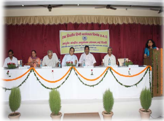
Hindi Workshop organized at ACRI, New Delhi