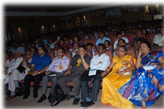
A View of National Seminar in progress at Gwalior