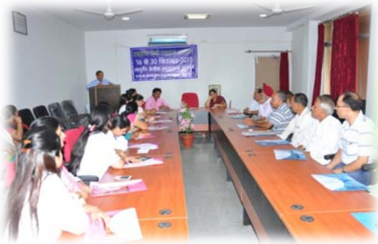
Celebration of Hindi Pakhwada at ARRI, Jammu