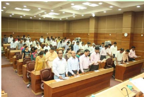
'Sandesh' of Hindi Pakhwara by DG CCRAS