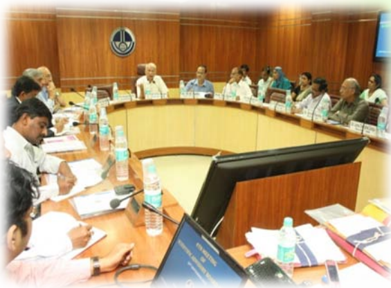
A view of 4th SAB (Scientific Advisory Board) meeting at CCRAS, Committee Room.