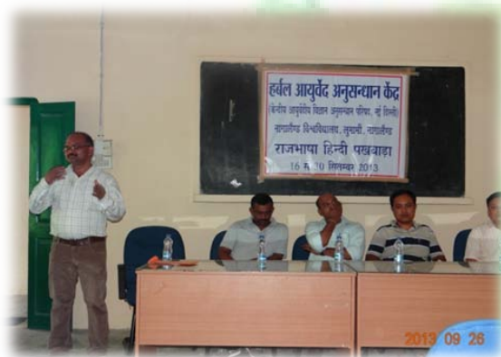
Celebration of Hindi Pakhwada by HARC, Nagaland (16th to 30th Sept. 2013)