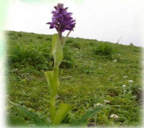
Hathajari ( Dactylorhiza hatagirea )

The institute made new records on occurrence of Indian Ginseng ( Panax pseudoginseng Wall) and an orchid ( Diplomeris hirsuta Lindl.) from Western Himalayas. The plants like Wallichia desiflora Mart. and Phynium placentrium Nees, which were considered diminished from about a century have been noticed and collected by the institute.