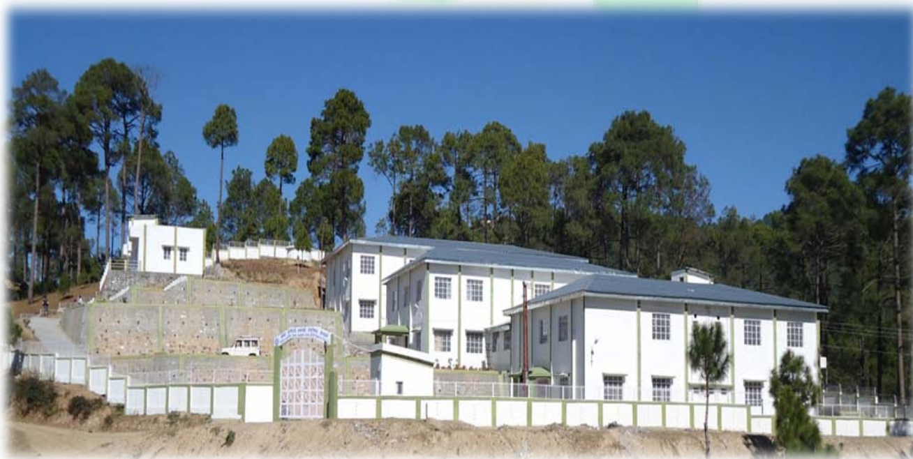
A view of the Institute