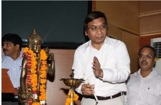
Inauguration of Hindi Pakhwara at AYUSH Auditorium