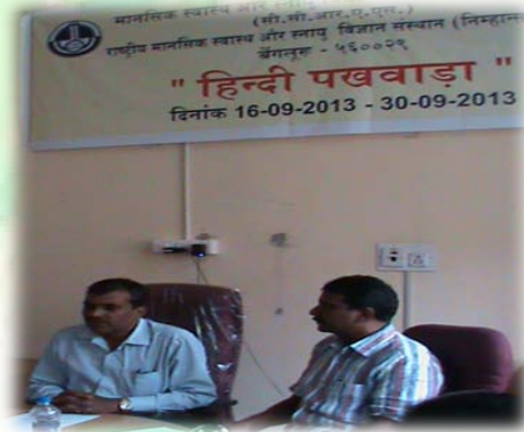
A view of Hindi Pakhwada celebration at ACAMHNS, Bangalore