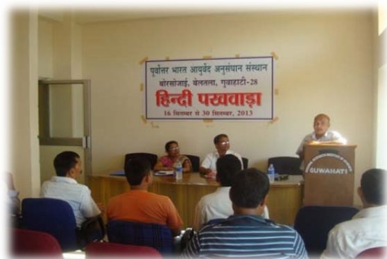
Celebration of Hindi Pakhwada at NEIARI, Guwahati (16th – 30th Sept., 2013)