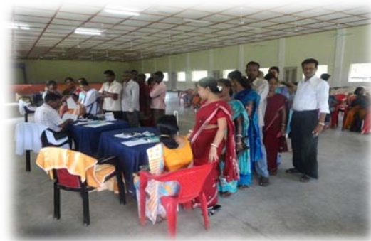
Free Ayurveda Camp at Ramkrishnapur on 27 th August 2013