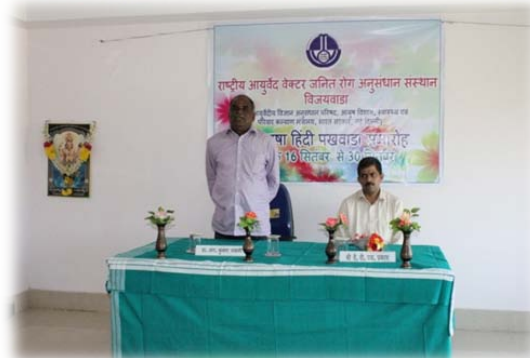
Celebration of Hindi Pakwada by NARIVBD, Vijayawada (16th to 30th September 2013)