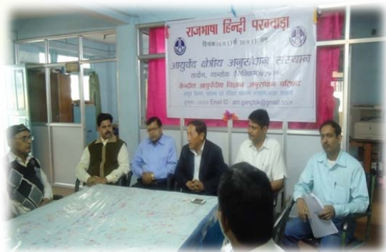
Celebration of Hindi Pakhwada by ARRI, Gangtok (16 th to 30 th Sept. 2013)