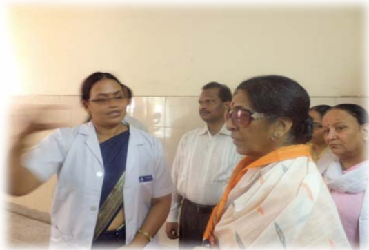
Visit of Honorable M.O.S. Smt. Santosh Choudhary to ACRI, Punjabi Bagh, New Delhi on 24.09.2013