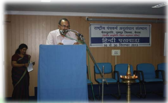
Celebration of Hindi Fortnight at NRIP Cheruthuruthy (16th – 30th September 2013)