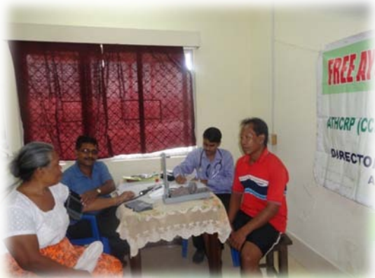
Ayurveda Tribal Health Care Survey at Herminder Bay on 26th August 2013

Tribal Health Care Survey of Nicobar tribes of Herminder Bay and free Ayurveda camps for general public of Ramkrishnapur and Farm Tekry, Little Andaman during 26 th -29 th August 2013. Through survey and Ayurvedic camp 109 tribal and 145 general people received Ayurvedic treatment. IEC material was also distributed and health awareness created among the populace of the area.